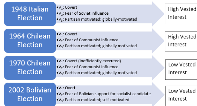
Figure 3. Visual summary of the results.

Notes: The variables are displayed with the summary of the results per each election.